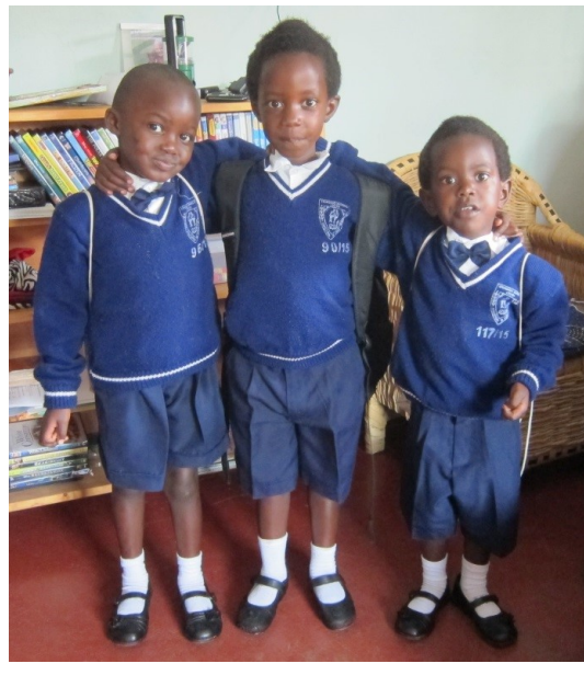
Hope Made Real ~ hopemadereal.org