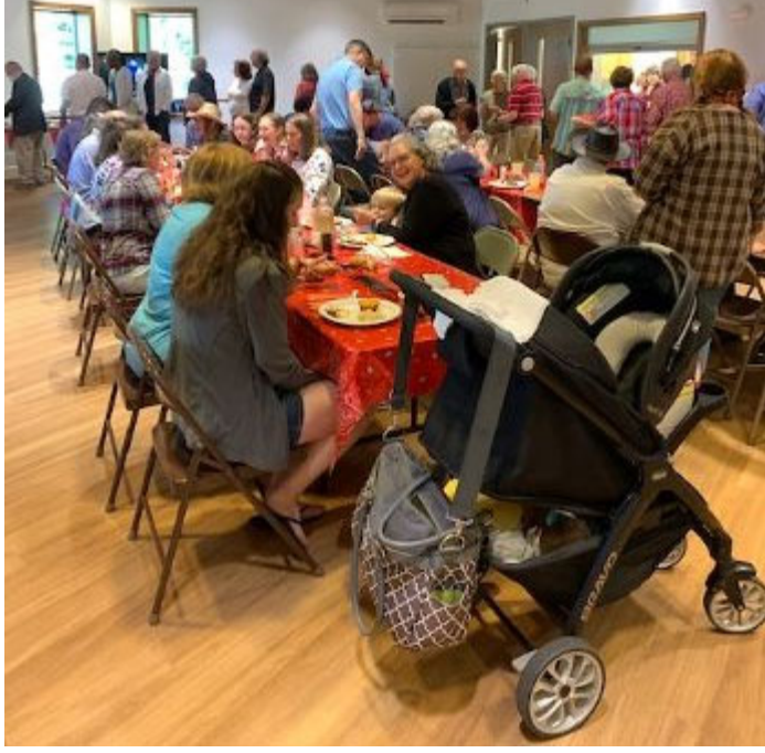
We the people doing what we like best - eating!!