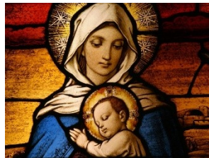
Christmas Eve/Day 2016

The four classes will meet on the 1 st and 3 rd Saturdays of January and February for about 90 minutes. (January 7, January 21, February 4, and February 18). Contact Karl Raynar with any questions.