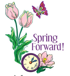
Don't forget to turn your clocks ahead one hour on Saturday night.

The email address for Trinity's office is changing from tlcmarla@comcast.net to tlcoffice2@comcast.net.