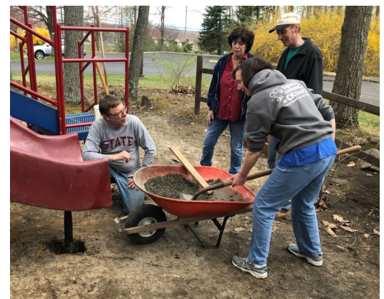
Some of the work accomplished at last Saturday's Spring Work Day.