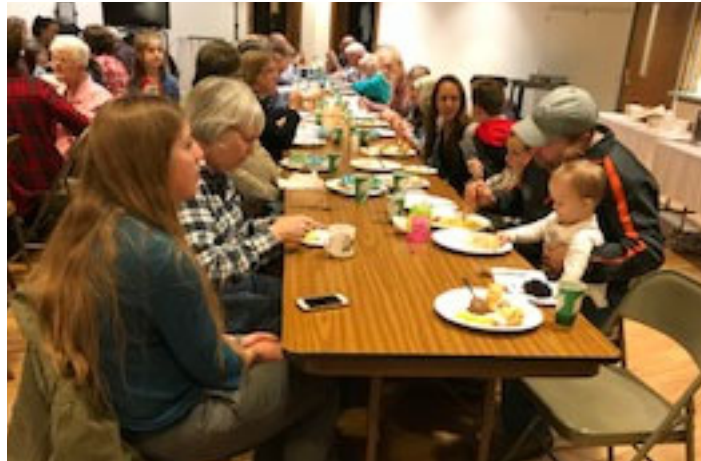
Enjoying the evening, the fellowship & the food.