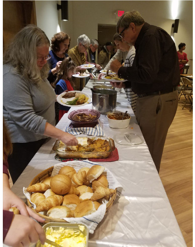
Lots of Good Food