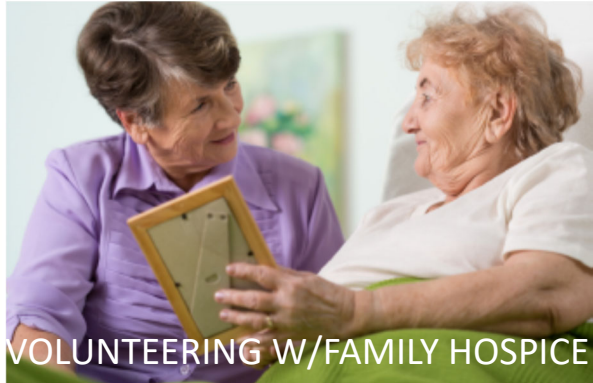
VOLUNTEERING W/FAMILY HOSPICE

Notes of Condolence due to Jeff Bastuscheck's Death can be sent to: COLLEEN BASTUSCHECK 14431 Traville Gardens Circle #305 Rockville, MD 20850