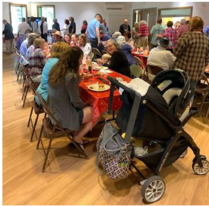
We the people doing what we like best - eating!!