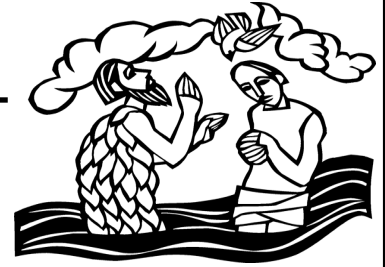
Baptism of Our Lord

2221 North Oak Lane State College, PA 16803 814-238-2024 www.trinitystatecollege.org