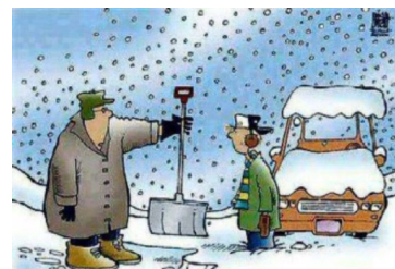
SORRY, SON...THERE'S NO APP FOR THAT

All are welcome to join the fun with this group!